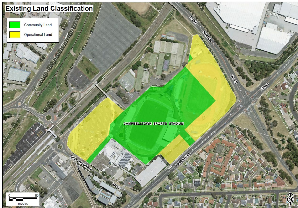
Figure 3: Current land classification for the subject site. Green represents community land and yellow is operational land.

The planning proposal does not seek to amend the zoning or any other planning controls under CLEP 2015.